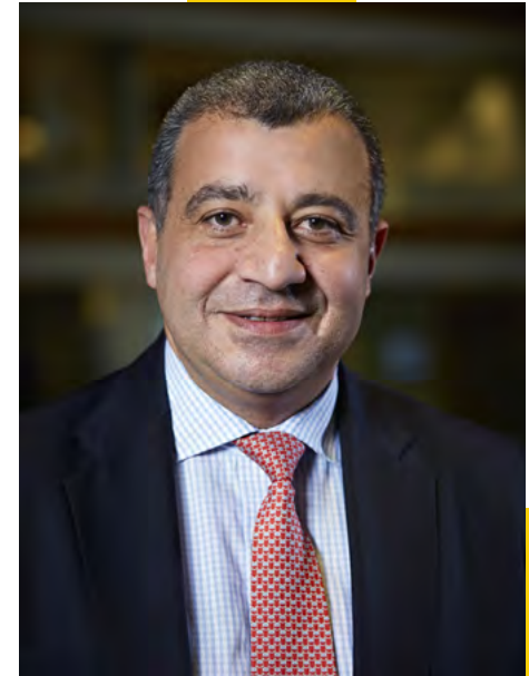
Ben van Beurden, CEO

“...like the worldwide distribution of reserves and resources, creativity and innovation are not the domain of one country, culture or gender. We must hire where we work and develop ideas and future business opportunities where innovative ideas and practices are found.”